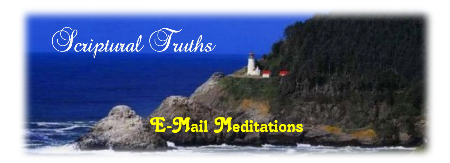
The Lord Will Come ... Perhaps Today ... Behold, I Come Quickly ... Rev. 22:7