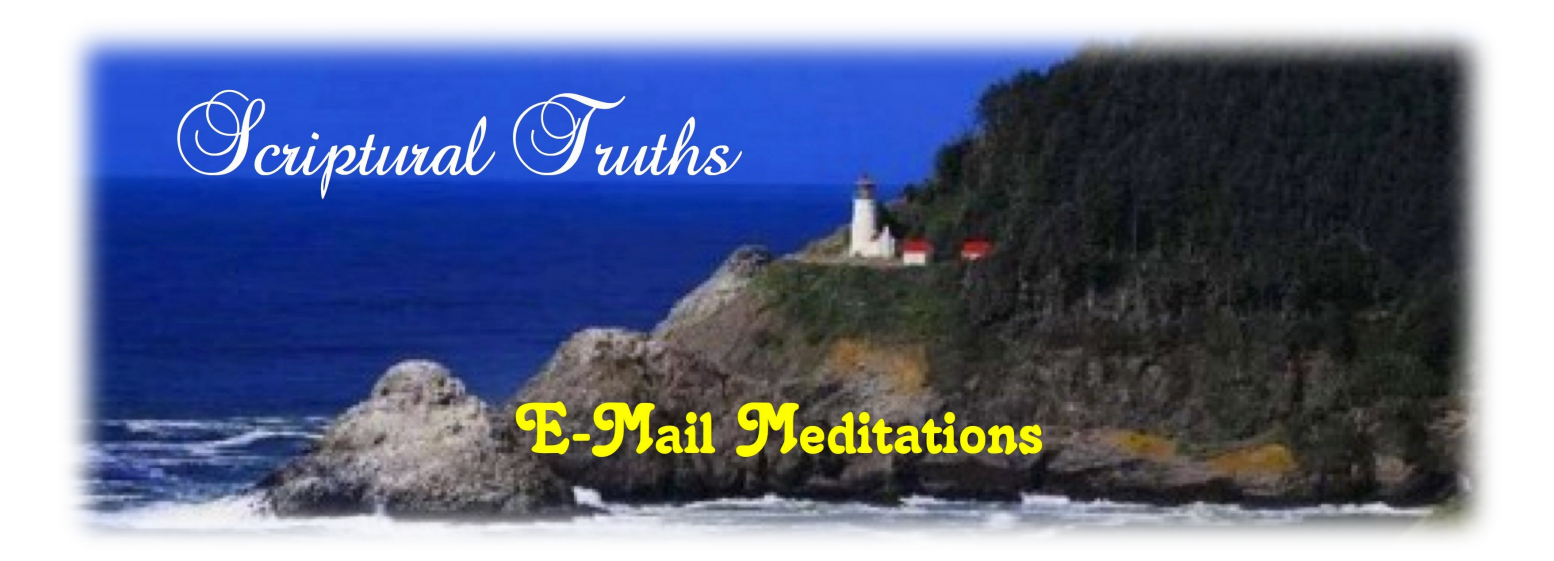
The Lord Will Come ... Perhaps Today ... Behold, I Come Quickly ... Rev. 22:7