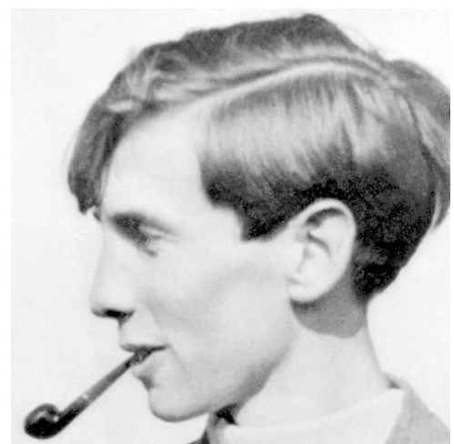
Alexander Schmorell 16 Sept. 1917 - 13 July 1943 Student of Medicine