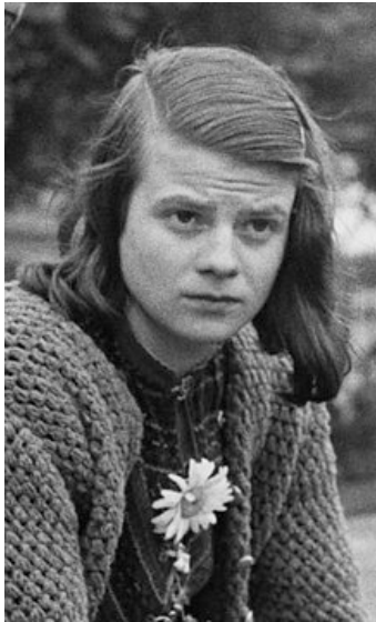
Sophie Scholl 9 May 1921 - 22 Feb. 1943 Student of Medicine University of Munich