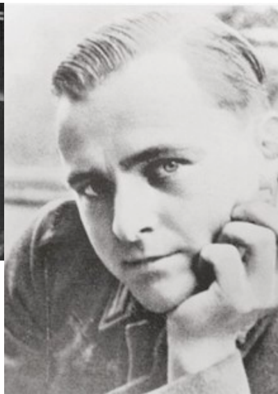
Willi Graf 2 Jan. 1918 - 12 Oct. 1943 Army Medic