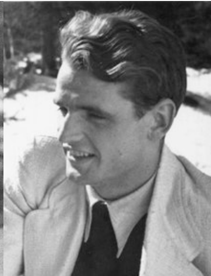
Hans Fritz Scholl 22 Sept. 1918 - 22 Feb. 1943 Student of Medicine University of Munich