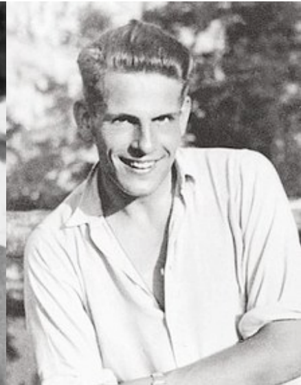
Christoph Probst 6 Nov. 1919 - 22 Feb. 1943 Student of Medicine University of Munich